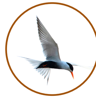
Black-Bellied Tern Nirmal, Kumuram Bheem Asifabad