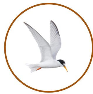
Little Tern Nirmal, Nizamabad