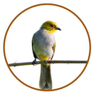
Yellow-throated Bulbul Nagarkurnool, Nalgonda