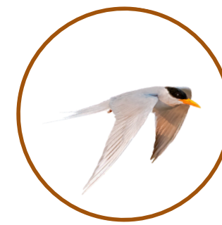
River Tern Nizamabad, Sangareddy