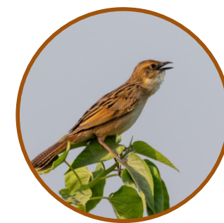
Bristled Grassbird Hoshiarpur, Rupnagar