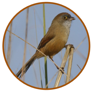
Jerdon's Babbler Ferozepur, Kapurthala