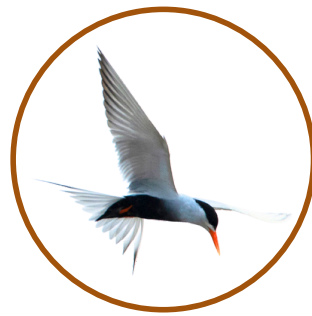
Black-bellied Tern Ferozepur, Ludhiana