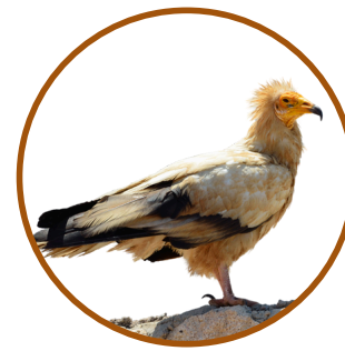
Egyptian Vulture Hoshiarpur, Kapurthala