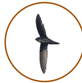
Dark-rumped Swift Kohima, Phek