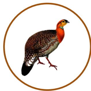
Blyth's Tragopan Kiphire, Kohima