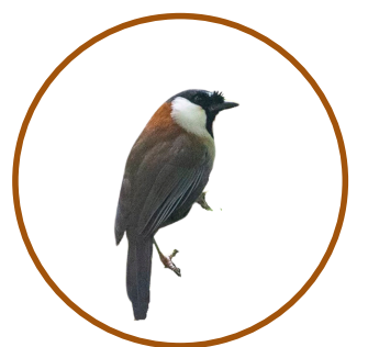
Chestnut-backed Laughingthrush Wokha