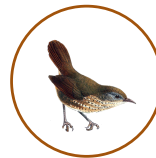
Naga Wren Babbler Kohima, Phek