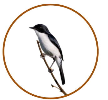
Jerdon's Bushchat Bishnupur