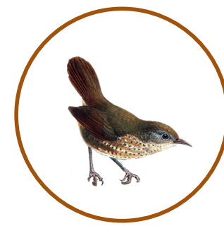
Naga Wren Babbler Ukhrul