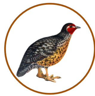
Manipur Bush Quail Jiribam, Kakching