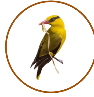
Slender-billed Oriole Bishnupur, Kangpokpi