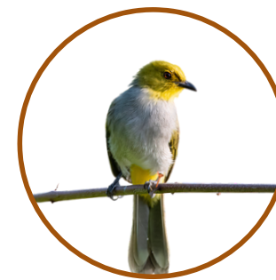
Yellow-throated Bulbul Ballari, Ramanagara