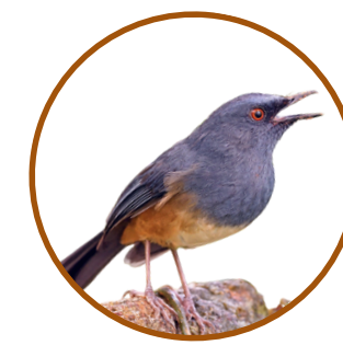
Nilgiri Sholakili Dakshina Kannada, Kodagu