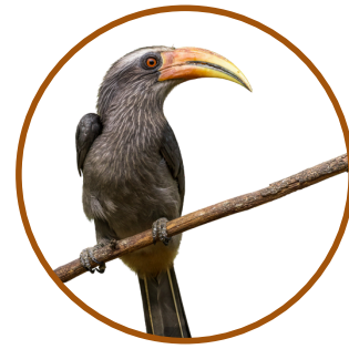
Malabar Grey Hornbill Kodagu, Uttara Kannada