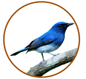
White-bellied Blue Flycatcher Shivamogga, Uttara Kannada