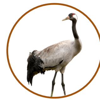
Common Crane Mehsana, Surendranagar