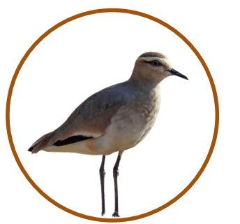
Sociable Lapwing Kachchh, Ahmedabad