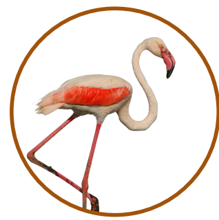
Greater Flamingo Mehsana, Porbandar