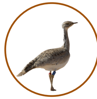
Macqueen's Bustard Kachchh, Surendranagar