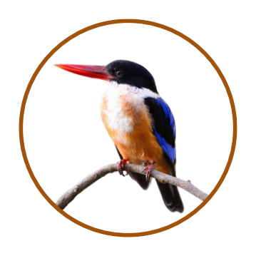
Black-capped Kingfisher North Goa, South Goa