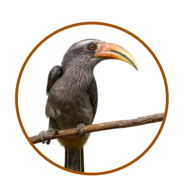
Malabar Grey Hornbill North Goa, South Goa