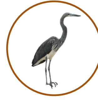
White-bellied Heron Anjaw, Changlang