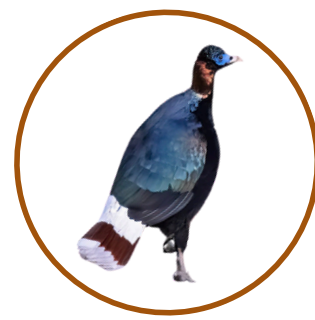
Sclater's Monal Lower Dibang Valley, Tawang