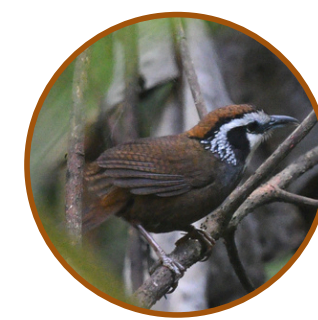
Snowy-throated Babbler Changlang