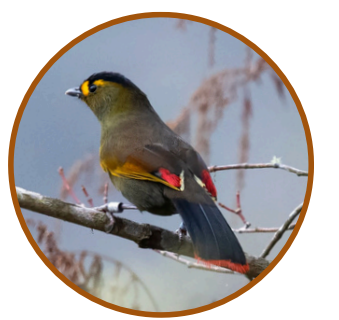
Bugun Liocichla West Kameng